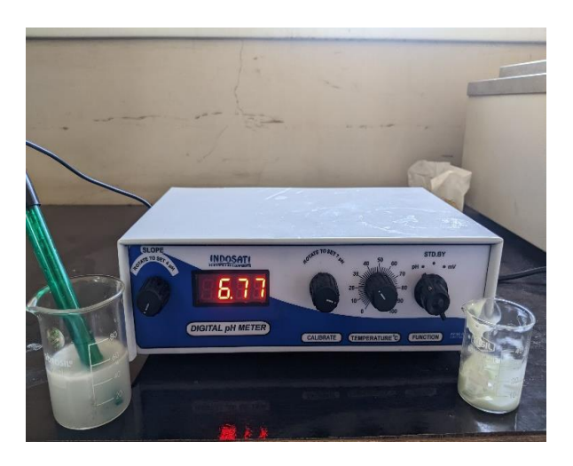
Figure no. 4:pH test

By dissolving 1 gram of cream in 100 milliliters of water, a digital pH meter was used to measure the pH of the formulated cream. By dissolving the pH paper in the cream solution mentioned above, the pH of the cream was also identified [24].