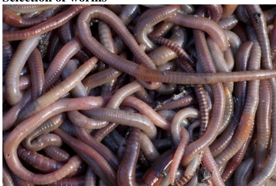
Fig: 1 Adult African earthworm Eudrilus eugeniae