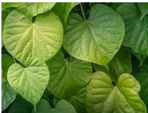
Giloy leaf [20]