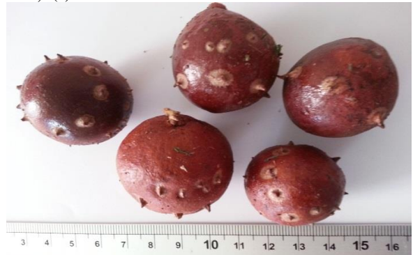
Fig (1): Gall of Quercus infectoria Olivier collected from Erbil governorate, Kurdistan region of Iraq.

Plant material: Quercus infectoria olivier galls (Figure. 1) were collected locally from Qalasnj village on Safeen Mountain in Erbil governorate in September and December 2015 and authenticated by Professor Saleem Shahbaz, Taxonomist, University of Duhok . The galls were washed with distilled water, left dry at room temperature before they were crushed and ground prior to the extraction.