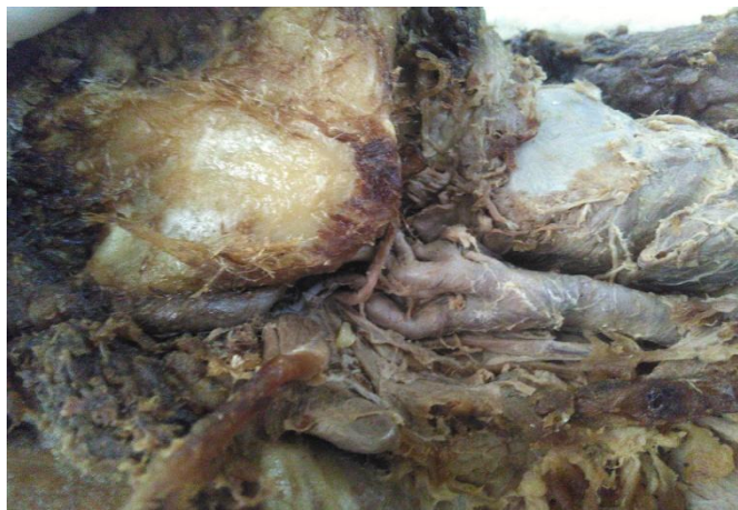
Figure 4: Normal position of ECA (posteromedial)