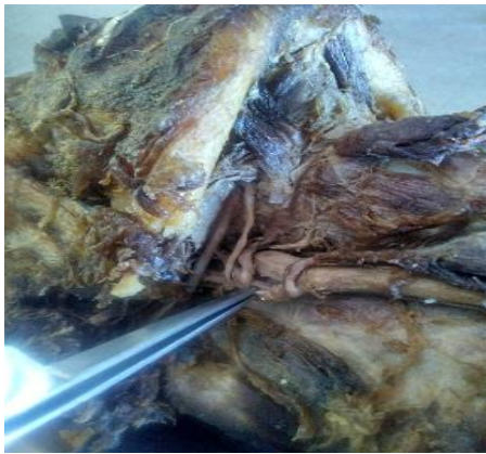
Figure 1: Posterolateral disposition of ECA

In addition during preoperative selective angiograms, the Radiologists need to be aware of encountering such arterial variations. Carotid endarterectomy of cervical ICA, is the mainstay treatment in atherosclerotic plaque. Due to the inverse relation of the ECA and ICA, the anterior branches of ECA coursing over the ICA may hinder the adequate exposure of the carotid arteries for cross clamping, during removal of the plaque [13] . Hence consideration of this important variant is mandatory to carry out endarterectomy and to minimize postoperative complications.