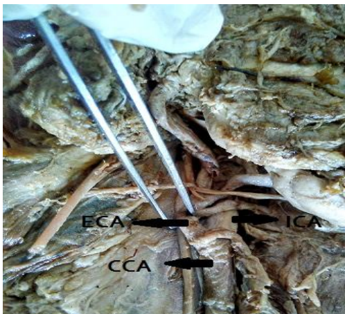
Figure 3: Hypoglossal nerve crossing ECA and then ICA