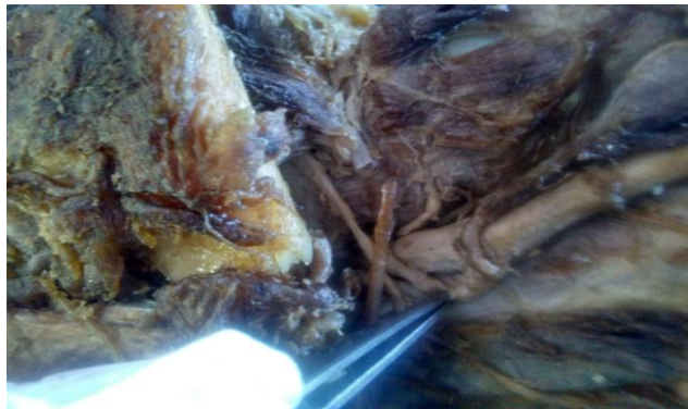
Figure 2: Anterior branches of ECA crossing ICA in carotid triangle ( right)