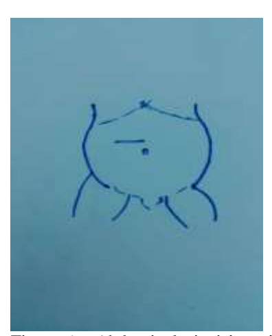
Figure-6: Abdominal incision in infants and neonates for duodenal obstruction should be sited