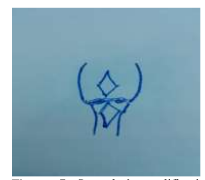
Figure -7: Surender's modification for duodenoduodenal anastomosis performed over longitudinal incisions proximal and distal to obstruction.

Figure-8: Proximal and distal duodenotomy wounds are sutured transversely.