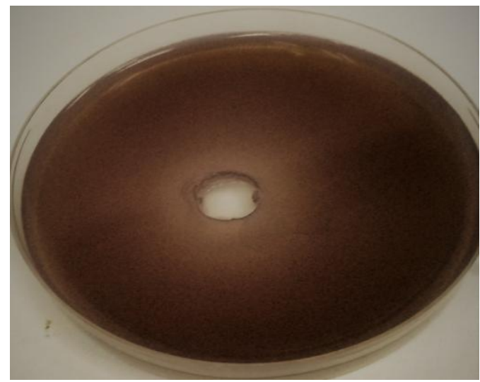
Figure 1. Testing the AHL degrading activity of the recombinant overexpressed lactonase using CV026 as a biosensor, the zone with no purple colour indicates degradation of AHL.