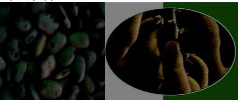
Fig. 3 Fig.4