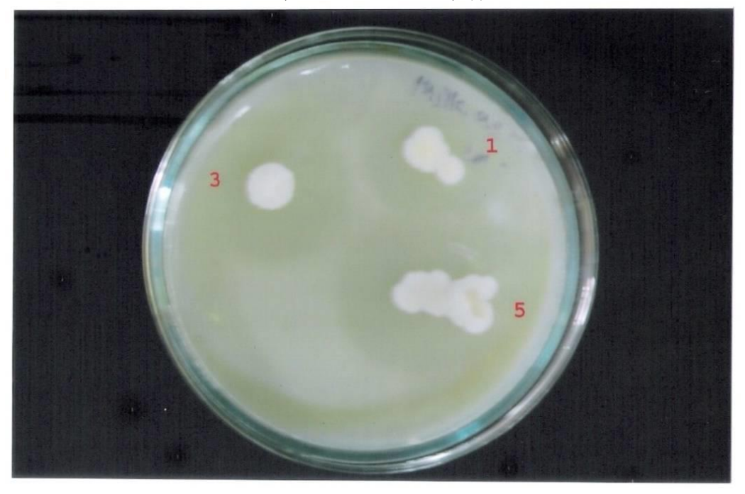
Figure 1: Caseinase activity for sample no-1, 3, and 5.