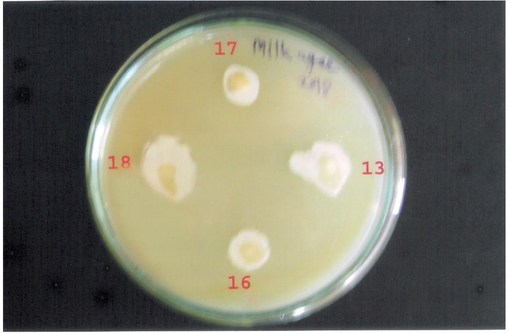
Figure 3: Caseinase activity for sample no-13, 16, 17 and 18.

16Sr RNA sequencing for isolate I: >Sample no. 1A_704F