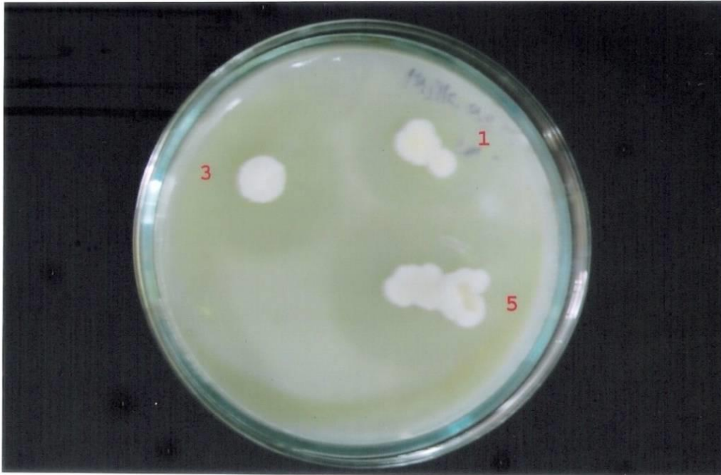
Figure 1: Caseinase activity for sample no-1, 3, and 5.