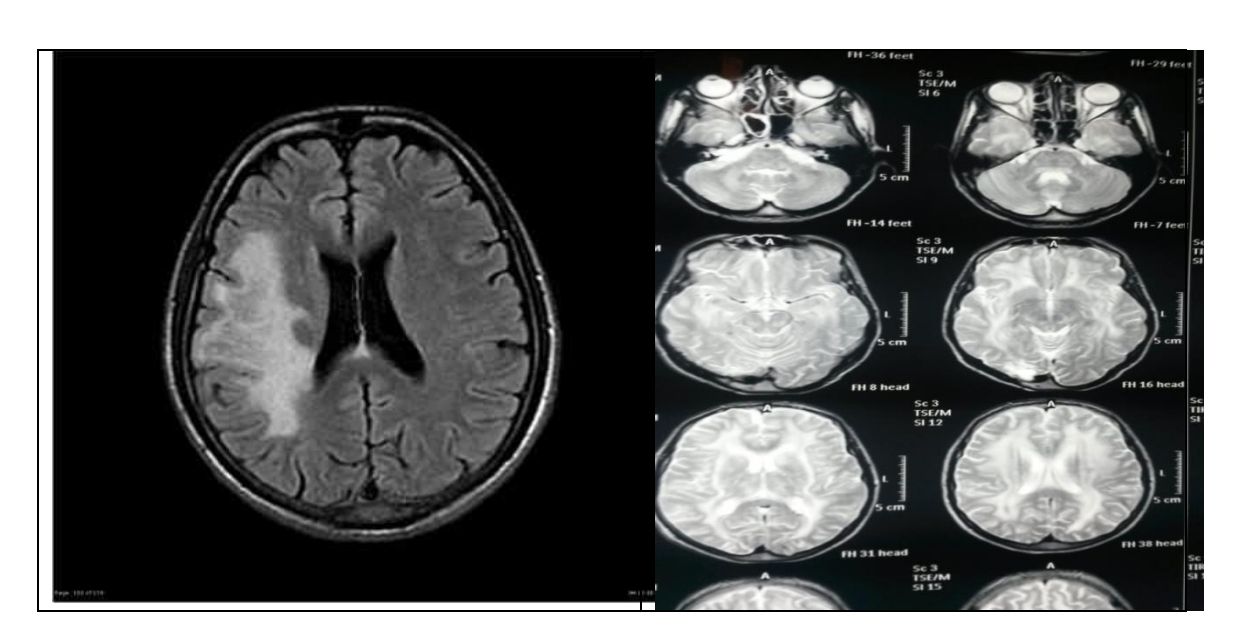
Photo (6): MRI brain with contrast revealed bilateral diffuse and symmetrical cerebral and cerebellar white matter abnormal high T2 and FLAIR signal.

MRI brain with contrast revealed bilateral diffuse cerebral and cerebellar as well as brain stem white matter disease with small right occipital encephalomalacia and bilateral basal ganglia lesions. The possibility of mitochondrail disease is considered for further clinical correlation.