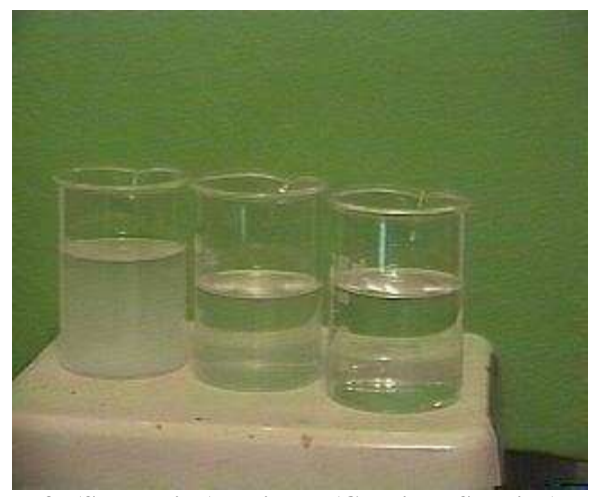
Left (Suspension), Middle (Colloidal Solution), Right (True Solution)

Suspension, Colloidal Solution and True Solution: Based on distinct properties, solutions can be classified into Suspension, Colloidal Solution and True Solution. This classification is necessary to understand concepts of colloidal solutions and distinguish it from rest of the types.