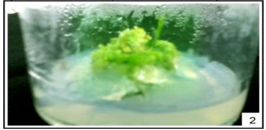
Fig.3: Callus observed after 60 days of incubation with the 2, 4-D concentration itself.

Fig.2: Callus observed after 40 days of incubation 2, 4-D of 2.0 mg/L concentration.