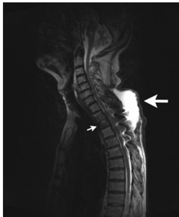
Figure 3: MRI of the thoracic spine (T2-weighted, sagittal reconstruction).

programs should also be initiated as there is chance for co-infection with HIV.