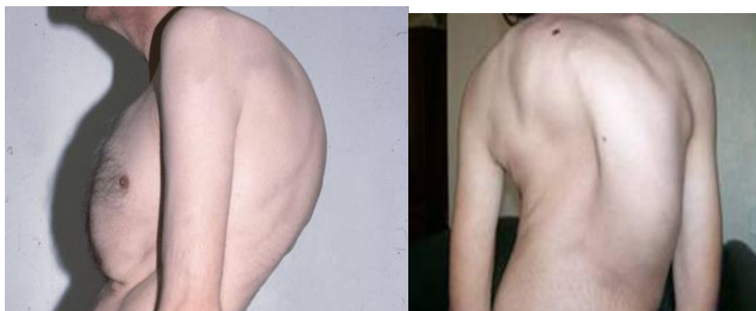
Figure 1: Spinal TB affected patients

Pott's disease, also called tuberculosis of the spine, disease caused by infection of the spinal column or vertebral column mainly by the tuberculosis bacillus, Mycobacterium tuberculosis . Pott disease is characterized by softening and collapse of the vertebrae, resulting in a hunchback curvature of the spine. The condition is named after an English surgeon, Sir Percivall Pott, who described it in a monograph published in 1779. The infection begins in the vertebra and spreads slowly to contiguous structures. Abscesses may form and drain into soft tissues adjacent to the spine, causing pain in sites distant from the infection. As a result the spinal nerves are affected, and paralysis may result. The course of the disease is slow, lasting months or years. Treatment includes chemotherapy against the M. tuberculosis bacillus and orthopedic care of the spinal column. Modern treatment has made Pott's disease rare in developed countries, but in less-developed countries it still accounts for up to 2 percent of all tuberculosis cases and particularly affects children [1,2,3].