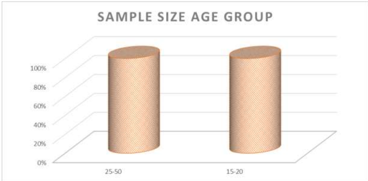
Figure 1 Age Group Distribution affected with schizophrenia

After result interpretation we noticed that stress are the big main cause of schizophrenia about 60% patients are affected due to any stress or painful events in their life or tensions ,2nd main cause are genetically transmitted about 30% and 3rd main cause are addiction about 10%. [Shown in Figure No 1 & 2] with most affected age group included 15-20 years of age.